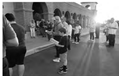
Praying Stations of the Cross together!