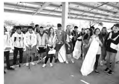
Thank you for another great Roadway Clean up!