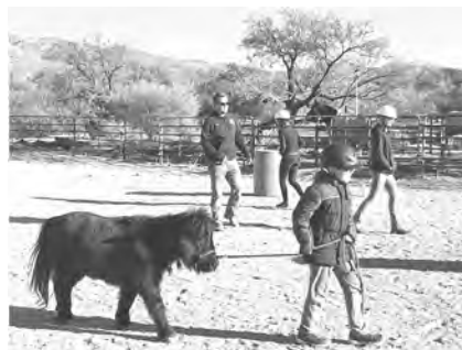
So proud of our youth helping with lessons at Angels in Autism Equine Therapy program and so impressed with the student and instructor too!