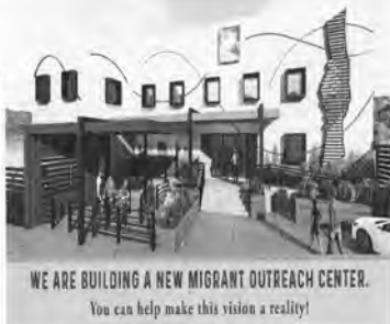
WE ARE BUILDING A NEW MIGRANT OUTREACH CENTER. You can help make this vision a reality!

El Comedor, part of the Kino Border initiative, provides humanitarian aid to thousands of men, women and children who have been deported to Nogales, Sonora, Mexico