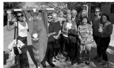
Some attendees from Corpus Christi parish...