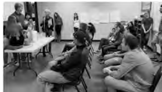
High School YG - Holy Spirit demonstration & discussion on the wondrous Gifts and Fruits of the Holy Spirit!