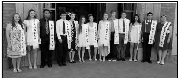
CONFIRMATION CLASS 2018