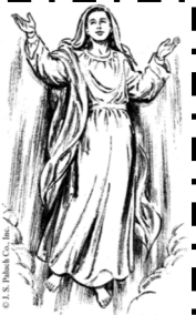
Assumption of the Blessed Virgin Mary

Wednesday, August 15, is the Feast of the Assumption of the Blessed Virgin Mary, a Holy Day of Obligation. Masses for that day will be in the church on Tuesday evening, August 14, at 6pm and Wednesday morning, August 15, at 8am.